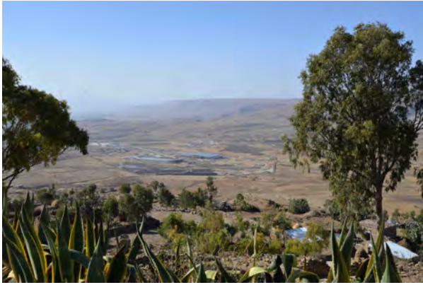
Bilet seen from Igre Hariba