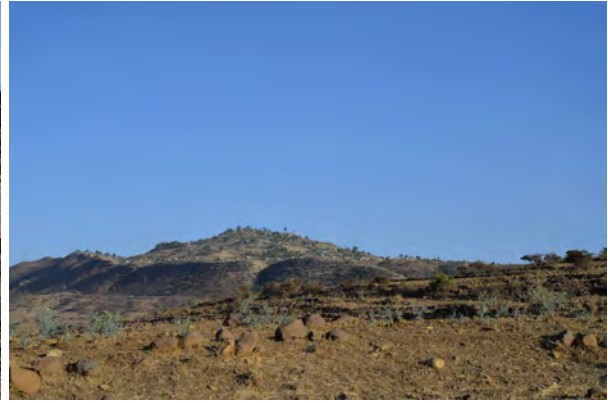
Igre Hariba seen from Bilet

This toponymic evidence is all the more important. According to the 19 th -Century testimony of Nathaniel Peirce, at a time when Igre Hariba was the main place of (and the name given to) the whole area, we named this fieldwork “Igre Hariba” and first surveyed the village known today as Igre Hariba. But the evidence we were looking for seemed to be located in the area called today “Kwiha”, since the latter replaced the former as the main place (and the main name) of the area after the construction of the road in the 1930’s.