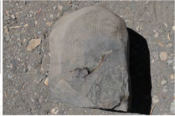
Basalt stone kept in Kwiha Kerkos church: H. 31 x W. 20 x Th. 20 cm. Only the first seven lines of the inscription are partly preserved.

Ato Goitom Besrat introduced us to Ato Neguse Hagos, a farmer living in the vicinity of the Kwiha Kirkos church. Ato Neguse Hagos confirmed the location of the place name “Bilet”, on the Eastern side of the road. He also informed us that a stone bearing an Arabic inscription was currently lying in the fields of Bilet, used with other stones to delineate paths and plots of land.