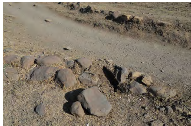
Sample of stelae used in Bilet to delineate paths and plots of land

A first stone was found on 9 March according to Ato Neguse Hagos’ indications. GPS: 13° 29 mn. 17 s. North / 39° 32 mn. 56 s. East. Altitude: 2200 m.