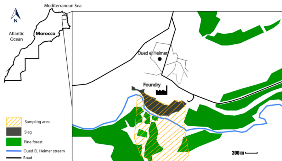
Figure 1. Plant and soil sampling area at Oued el Heimer site.