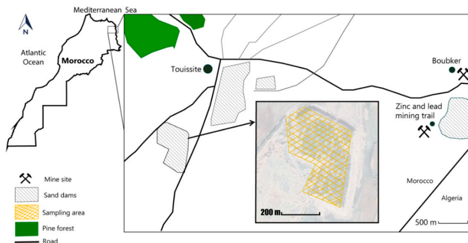
Figure 2. Plant and soil sampling area at Touissite site.