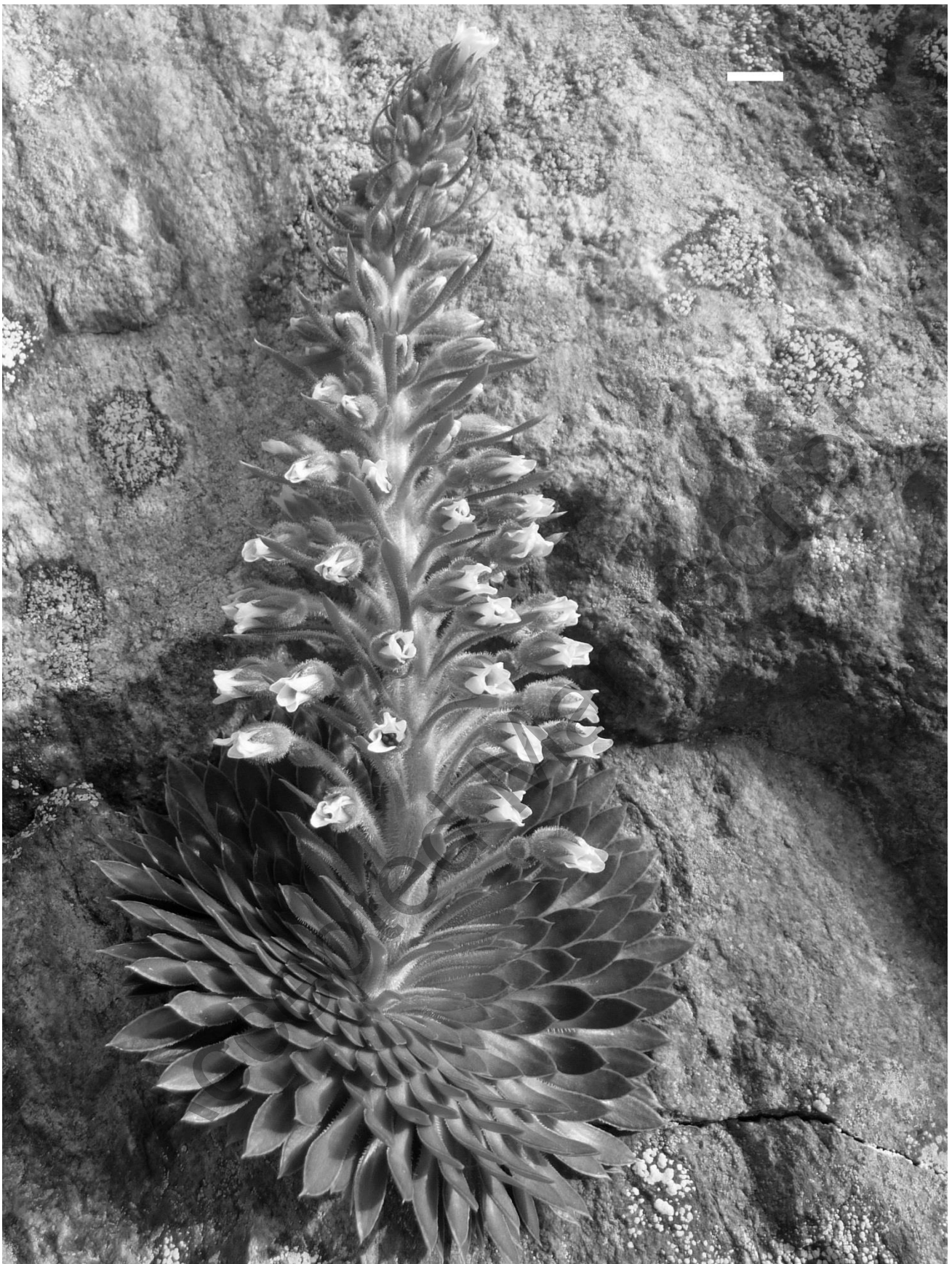
Fig 1 - Saxifraga florulenta in its natural habitat. The inflorescence blooms first with the terminal flower and later produces acropetally blooming waves. Bar = 2 cm.