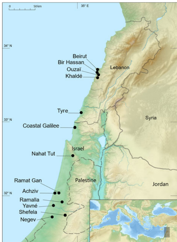
FIG. 1 Present and historical distribution of Astragalus berytheus on the eastern Mediterranean coast (see Supplementary Table 1 for additional details). The only extant population in Lebanon is in Tyre Coast Nature Reserve (see text for details).

(Family Asteraceae), which originated from the USA; it is an invader of coastal sand dunes (Sternberg, 2016) and was introduced into the Middle East in 1975 (di Castri et al., 1990). It was first observed in the Reserve in 1999 (Tohmé & Tohmé, 2009), and in 2015 it invaded A. berytheus habitat. Eradication has, however, allowed A. berytheus to recover