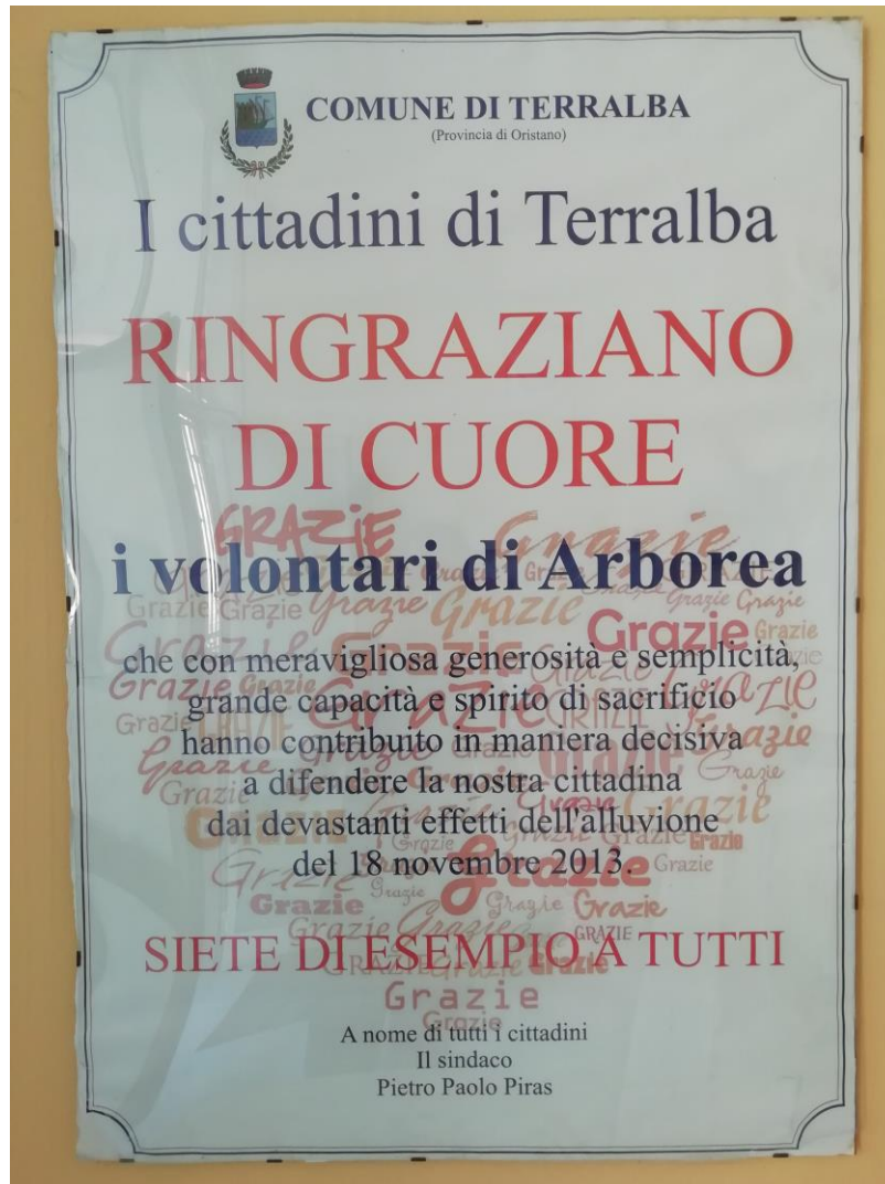
Figure 3: Residents of Terralba contribute a thank-you note to Arborea for generosity and sacrifice that their neighbours showed while defending their village from the devastating effects of flood on 18 November 2013.

solidarity between municipalities. That was the case in the devastating flash flood caused by a heavy rainfall from November 2013, when citizens from Terralba and Arborea worked together to manage the crisis [71] and where the residents of Terralba dedicated a letter of thanks to Arborea for their generosity and help during and after flood (Figure 3).