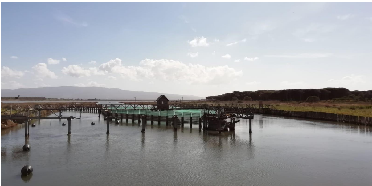
Figure 1: Traditional way of fishing at S'Ena Arubia lagoon, Arborea

Among Ramsar sites, the pond of Cabras is the biggest one. It is important for numerous species of water birds. In its direct proximity is the wetland of Mistras, which borders the coastal plain of the Gulf of Oristano, rich in bivalve molluscs and fish, making the municipality of Cabras a famous fishing site in the zone. Both of them are saltwater lagoons, located close to the mouth of Sardinia's main river Tirso. More to the South, a freshwater pond of S'Ena Arubia is the last remnant of a once broad complex of swamps and lagoons, converted in fertile land in the 1930s. In three lagoons, traditional fishing activities are allowed (Figure 1). Several traditional food and handcraft activities are still maintained in the area and they strictly relate to the presence of wetlands, accompanied by tourism activities.