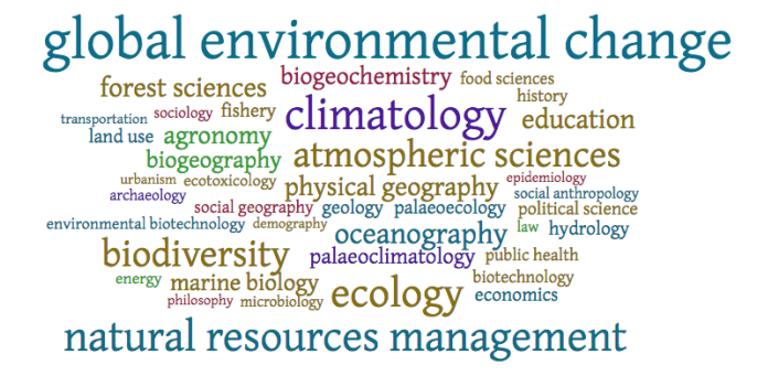
Figure 2: Scientific disciplines of MedECC members

MedECC members come from all Mediterranean sub-regions, with a broad and diverse range of scientific backgrounds (see Fig. 2), covering physical, chemical, biological, societal and economic aspects of the Mediterranean.