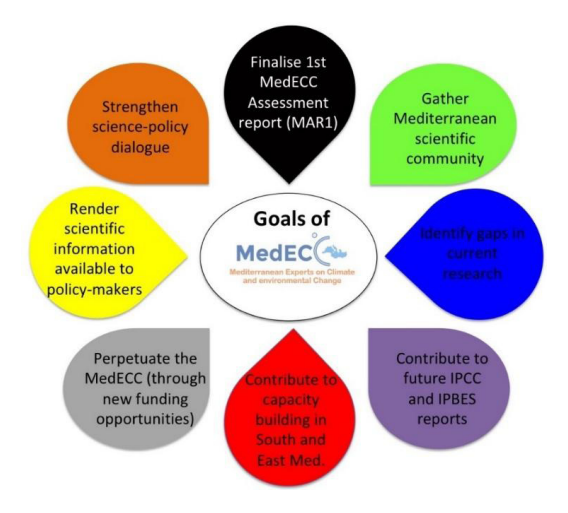
Figure 1: Goals of MedECC

changes across the Mediterranean, with clear goals summarized in Figure 1.