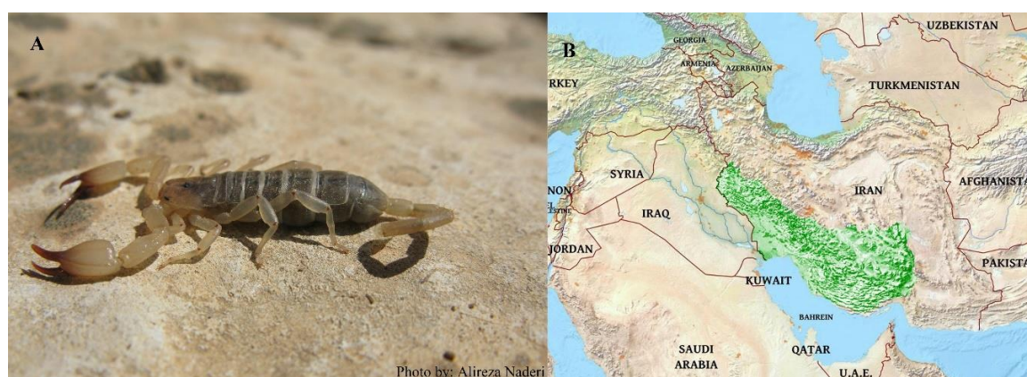
Figure 2. Image of Hemiscorpius lepturus in its natural habitat (A) and its distribution map in green (B).

According to Shahbazzadeh et al. [190], 12,150 scorpion stings were reported from medical centers in six cities in the Khuzestan province in 2003. The prevalence of human scorpion stings is 3.1/1000 residents. By region, the highest prevalence is in Masjed-Soleiman (27.1%), followed by Ramhormoz (26.6%), Izeh (15.3%), Shush (12%), Baghmalek (11.7%), and Behbahan (7.3%). The most scorpion stings are inflicted by Mesobuthus eupeus , Hottentotta saulcyi , Odontobuthus doriae , and Hemiscorpius lepturus , responsible for 53.3%, whereas 17.4% were related to Androctonus crassicauda and Hottentotta schach , and 29.3% to other species. The maximum and minimum frequencies occur in June and February, respectively.