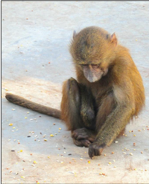
Figure 2. Pictures of juvenile olive baboons performing an unimanual grasping task.