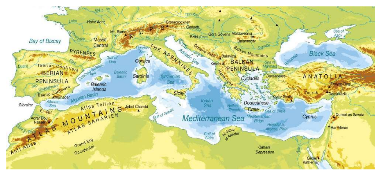
Figure 1.3 | Geography, physiography and landscapes of the Mediterranean Basin<sup>1</sup>

In political terms, the United Nations Environment Program Mediterranean Action Plan (UNEP/MAP)<sup>2</sup> covers 21 riparian countries, which are Contracting Parties (CPs) to the Barcelona Convention (excluding Jordan and Portugal, which are not riparian countries sensu stricto , and Gibraltar/UK and Palestine, which are not currently CPs but have observer status). The population of this so-defined Mediterranean region is about 480 million inhabitants (EEA 2020). From a geopolitical point of view, the Union for the Mediterranean (UfM)<sup>3</sup>, created in 2008, embodies a much wider spatial scope of 43 countries (all the countries of the European Union and 15 countries in the southern and eastern Mediterranean).