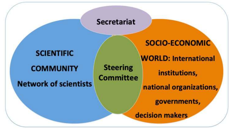
Figure 1.1 | Structure and functioning of MedECC

Since the founding of MedECC, two scientists at the French National Centre for Scientific Research (CNRS) coordinate the development and work of the network. Central to the governance of MedECC is its Steering Committee (SC, Figure 1.1) which met for the first time in April 2016 in Barcelona, Spain. The SC is currently composed of 20 members from 11 countries (Annex A.4.1), including 16 scientists in a personal capacity (representing environmental sciences, political sciences and economics) and 4 representatives of policy-making bodies: the United Nations Environment Programme/Mediterranean Action Plan – Barcelona Convention Secretariat (UNEP/MAP) and its Plan Bleu Regional Activity Centre, the Secretariat of the Union for the Mediterranean (UfM), and the Advisory Council for the Sustainable Development of the Government of Catalonia (CADS). More details on the work and accomplishments of the SC can be found in Annex A.4.1.2.