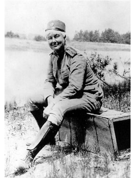
Flora Sandes, 1876-1956

"Give [women] a chance of the trenches (...) [I] am ready to form a Women's Battalion, the moment it becomes necessary for women to fill that fighting breach. Women have done more for their country than handle a rifle, and thousands of us are ready to do that too" - Mrs Alec Tweedie