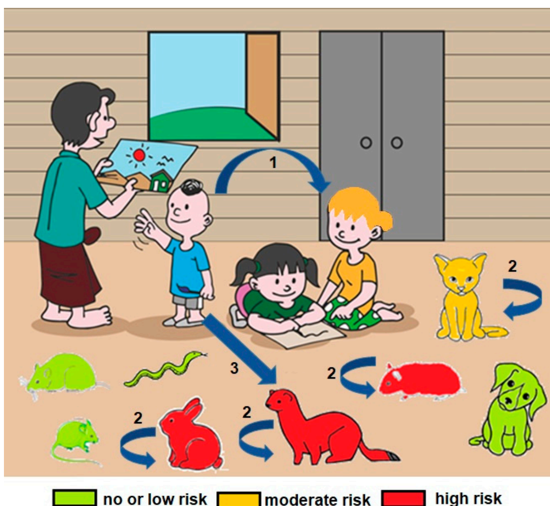
Figure 1. SARS-CoV-2 zoonotic risk associated with exposure to pets. The susceptibility of pets to SARS-CoV-2 infection, and therefore the potential risk of transmission of this virus from these animals to humans, can be evaluated as nul or low (green animals), medium (yellow) or high (red). The arrows and numbers indicate the currently demonstrated transmission chain of SARS-CoV-2: (1) from human-to-human; (2) from animal-to-animal within a specific animal species (cats, hamsters, and ferrets); and (3) from human-to-animal (cats and ferrets).