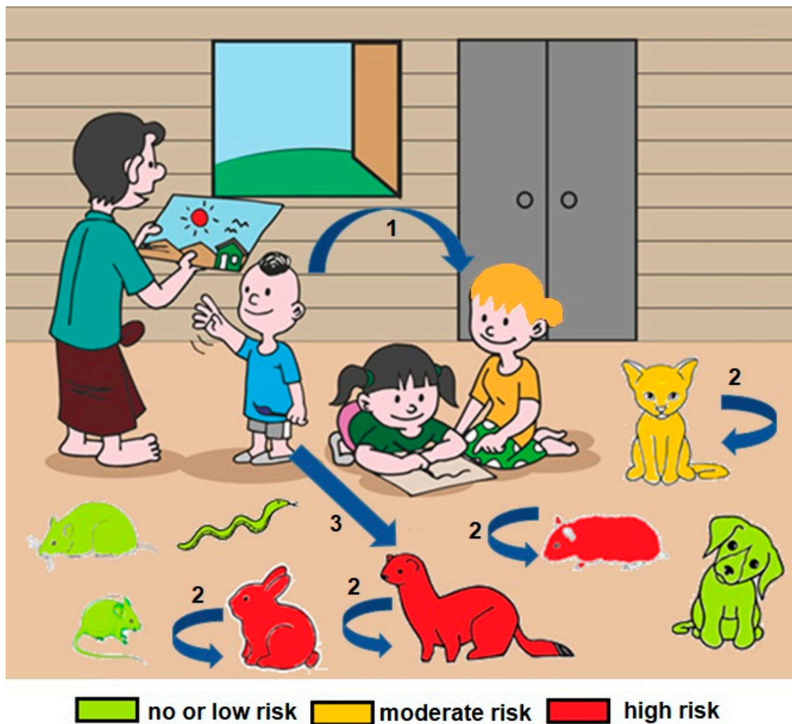
Figure 1. SARS-CoV-2 zoonotic risk associated with exposure to pets. The susceptibility of pets to SARS-CoV-2 infection, and therefore the potential risk of transmission of this virus from these animals to humans, can be evaluated as nul or low (green animals), medium (yellow) or high (red). The arrows and numbers indicate the currently demonstrated transmission chain of SARS-CoV-2: (1) from human-to-human; (2) from animal-to-animal within a specific animal species (cats, hamsters, and ferrets); and (3) from human-to-animal (cats and ferrets).