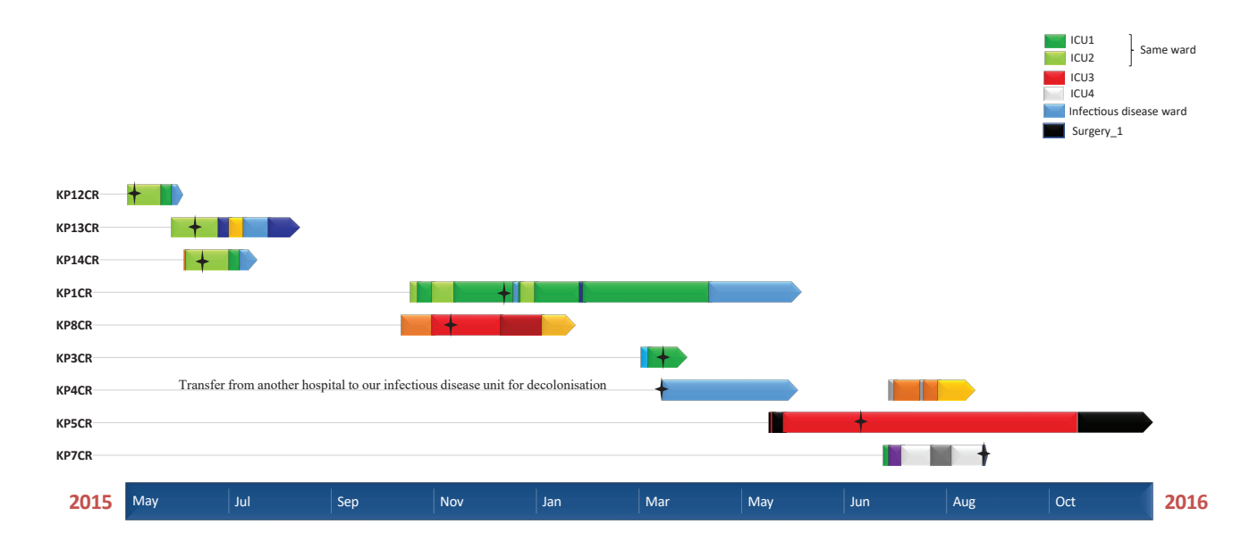
ST: sequence type; KP: Klebsiella pneumoniae; CR: colistin resistant.

Time of hospitalisations in different wards of cases of Klebsiella pneumoniae ST307 resistant to colistin and time of the respective bacterial isolation, Marseille, France, 2015–2016 (n = 9 cases)