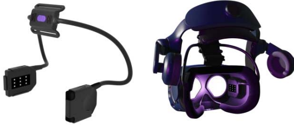
Figure 1: On the left, the Seenetic VR device, on the right, the Seenetic VR mounted on an HTC Vive Pro.

The Seenetic VR weighs 20 g equally distributed on both sides of the HMD. Increasing the weight and antero-posterior imbalance of the HMD by at least 100 g can reduce the user experience quality in VR [15]. However, the Seenetic VR low weight avoids such imbalance effects.