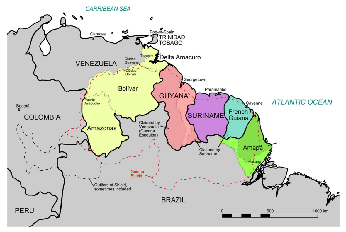
Fig. 1 Map of the Guiana Shield. Adapted from Arnold Platon - own work, based on this map and the map from this article, CC BY-SA 3.0, https://commons.wikimedia.org/w/index.php?curid=18445142

Q fever is ubiquitous, absent only in New Zealand. Its observed incidence varies from country to country, depending on the frequency of breeding, doctors' knowledge of the disease, the availability of microbiological diagnostic techniques, and the existence of dedicated epidemiological surveillance. Depending on the geographical area, endemic or epidemic situations are observed [1]. In endemic areas, cases occur, usually after risky activities (agriculture, slaughterhouse work, or rural tourism). This is the case in France, Spain, Greece, Israel, and the USA. The incidence of the disease is then linked to exposure to ruminants. Seasonality is observed, with two peaks of incidence in spring and early summer. Finally, large-scale epidemics can