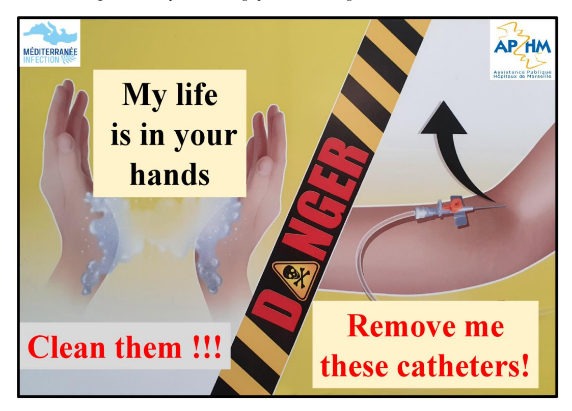
Figure 3. Display on bedroom doors, on the "healthcare" side.