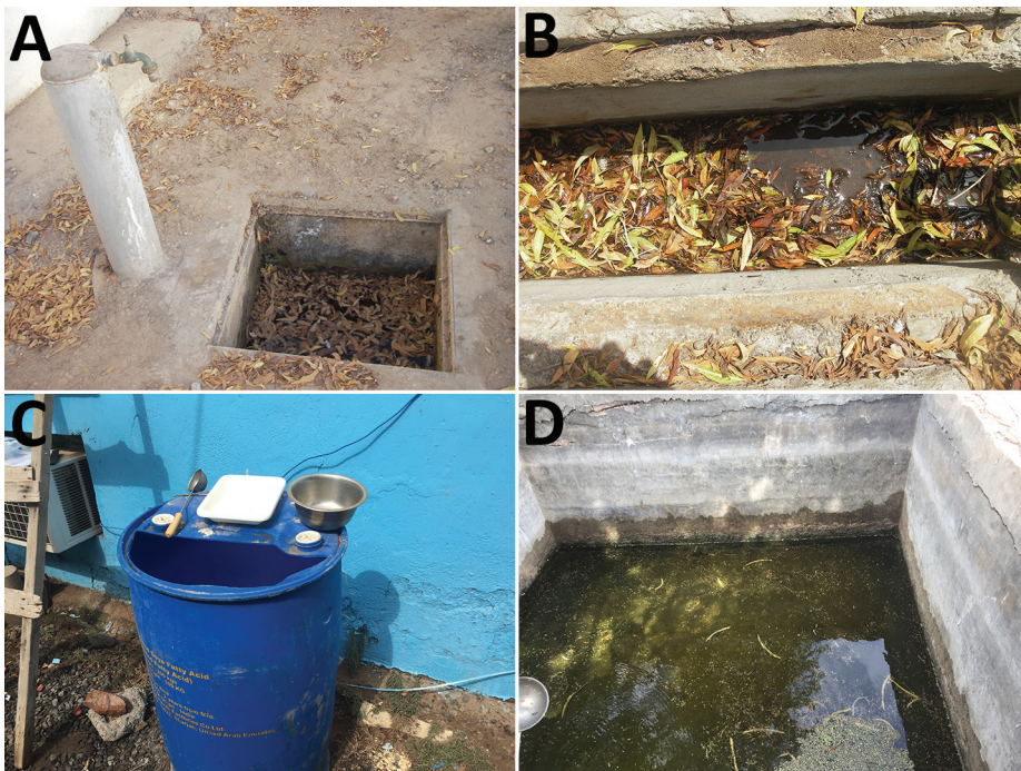
Figure 2. Anopheles stephensi breeding sites, Djibouti, Republic of Djibouti, 2019. A) Manhole. B) Ditch. C) Plastic drum. D) Water tank.

In the Republic of Djibouti, malaria transmission has increased since 2013. Even populations with strong malaria control programs, such as the FAF, are now affected. In 2018, the country notified the World Health Organization of ~100,000 suspected cases, mainly among febrile patients with negative results on a rapid diagnostic test (Appendix Figure 1). Considering these suspected cases, we believe the true