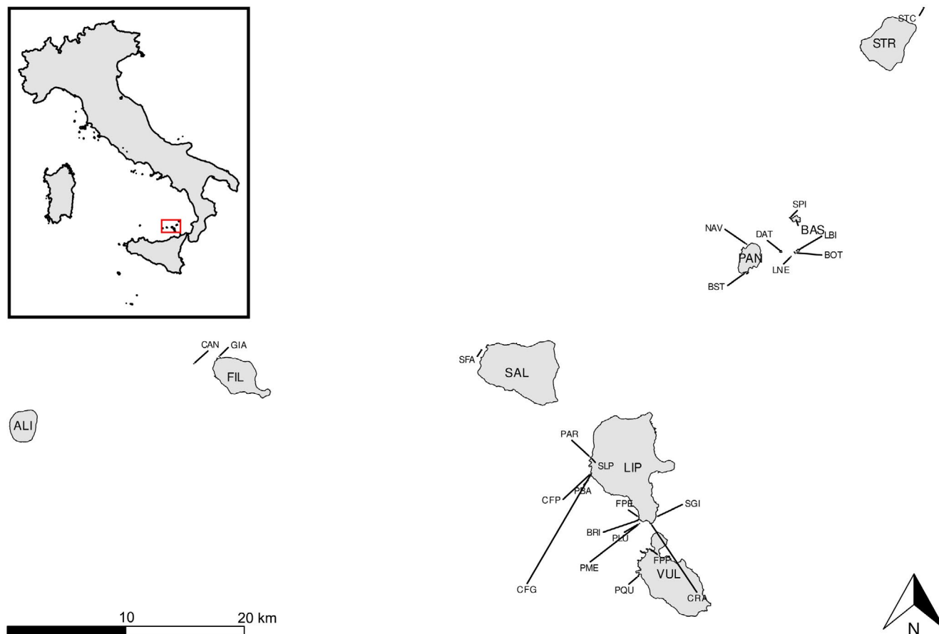
FIGURE 1 The Aeolian Archipelago, with the eight major islands and the 24 islets used in the present study. The acronyms identifying each island and islet are reported on Table S1

seamounts located west and north-west off the currently emerged Aeolian Islands, there is no evidence of the occurrence of other islands in the past (Beccaluva et al., 1985). Indeed, the Pleistocene sea level changes did not significantly affect the configuration of the archipelago with respect to the actual pattern, with Vulcano and Lipari being the only large islands which were connected during the glacial maxima.