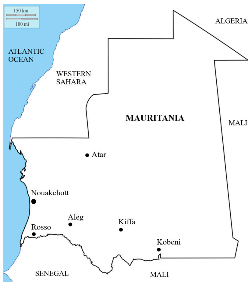
Study sites in Mauritania

Field studies were conducted in 2015–2018 in the following cities in Mauritania, from the north to the south, located in six of 12 provinces (locally called “Wilaya”) of Mauritania (Figure ??): Atar ( 20^{\circ}31'00'' N 13^{\circ}03'00'' W; 38,877 inhabitants, according to the latest available data from the National Statistic Office [? ], the regional capital of Adrar, located in northern Saharan region; Nouakchott ( 18^{\circ}06' N 15^{\circ}57' W; 958,399 inhabitants), the capital city of Mauritania where one-fourth of the population reside; Aleg ( 17^{\circ}3' N 13^{\circ}55' W; 111,512 inhabitants), the regional capital of Brakna in central Mauritania; Kiffa ( 16^{\circ}37' N 11^{\circ}24' W; 110,714 inhabitants), the regional capital of Assaba, southern Mauritania, located about 600 km from Nouakchott; Kobeni city ( 15^{\circ}49'02'' N 9^{\circ}24'39'' W; 92,690 inhabitants) in the province of Hodh Elgharbi, southeastern region of the country near the Mauritania-Malian border; and Rosso ( 16^{\circ}30'46'' N 15^{\circ}48'18'' W; 57,726 inhabitants), the regional capital of Trarza, located along the Senegal River in southwestern Mauritania along the border between Mauritania and Senegal. In total, approximately 63% of the total Mauritanian population reside in these cities [? ].