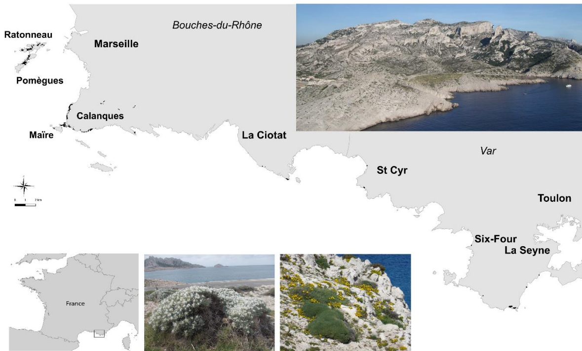
114 115 Fig. 1: Study area in Provence that encompass all French populations of Astragalus tragacantha L., 116 1753. The black dots on the map are indicating all A. tragacantha occurrences detected by our survey 117 in 2019. Pictures: Calanques habitats and A. tragacantha cushions, Marseille, France.

110 sandy soils (city of Saint-Cyr). The eastern populations, from 5.80°E to 5.88°E longitudes, are mainly 111 present on phyllite cliffs (cities of Six-Fours-les-plages and La Seyne-sur-mer). The extent of 112 occurrences was split in 7 sectors and then in 32 subsectors (according to the toponymy) to 113 summarize demographic data (Table 1).