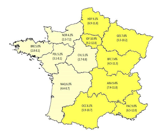
Figure 3. Prevalence of detected SARS-CoV-2 infection in the French working-age population (December 2020). Figure legend: Auvergne-Rhône-Alpes (ARA), Bourgogne-Franche-Comté (BFC), Bretagne (BRE), Cen-tre-Val de Loire (CVL), Grand Est (GES), Hauts-de-France (HDF), Ile-de-France (IDF), Normandie (NOR), Nouvelle-Aquitaine (NAQ), Occitanie (OCC), Pays-de-la-Loire (PDL), and Provences-Alpes-Côte-d'Azur (PAC).

A representative sample of 6007 adults aged 18–64 years residing in twelve regions of France participated in the online survey from 30 November to 16 December 2020. Of them, 8.1% (95% CI, 7.5–8.8) reported a prior SARS-CoV-2 infection (1.1% hospital admission for COVID-19; 1.7% medical diagnosis of COVID-19 without a virology test; and 5.3% positive test for SARS-CoV-2 infection diagnosis with (2.9%) or without (2.4%) symptoms). The prevalence rate of detected SARS-CoV-2 infection significantly varied across regions (p < 0.0001) according to an East–West gradient (Figure 3; Supplementary Table S2).