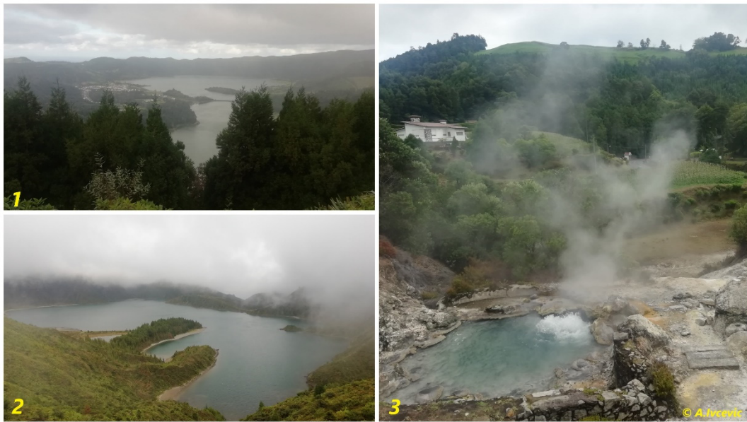
Figure 2. Major active volcanoes on the São Miguel Island: 1 Sete Cidades, 2 Fogo, 3 Furnas.