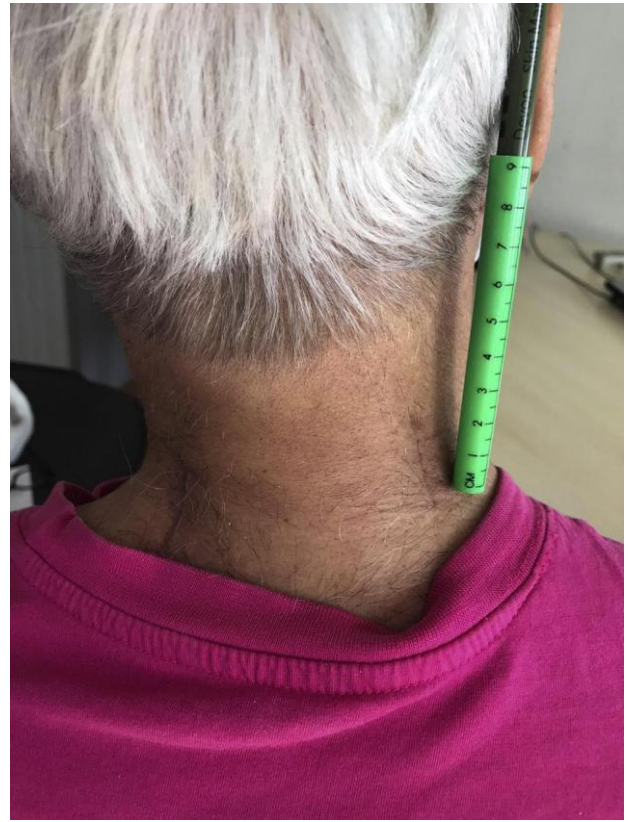
Figure 3. Two 2-cm paramedian vertical wounds.

All the operative team stayed outside the OR during imaging acquisition.