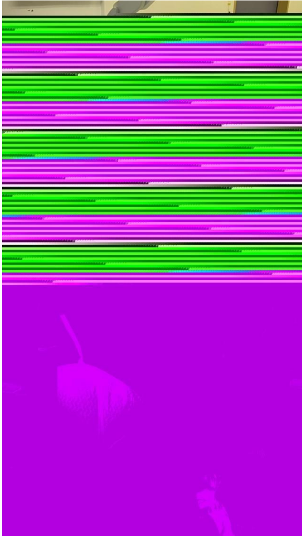
Figure 2. Intraoperative photograph showing the Cirq positioned in a way to use the 1.5-mm-diameter navigated drill with image guidance to create a pilot hole on the dorsal cortex of the right C5 pedicle before introducing the K-wire. Note the other K-wire already positioned within the C5 left pedicle.