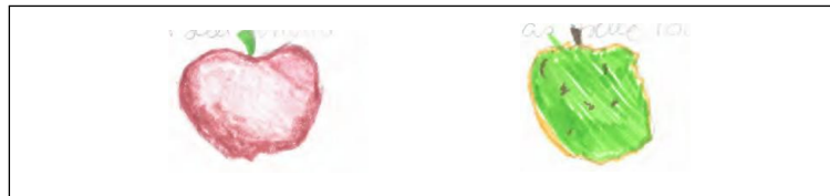
Figure 1. A beautiful and a not beautiful apple: An example of a child's drawing