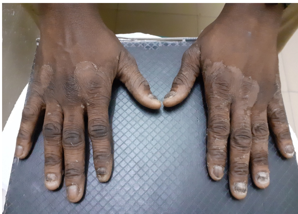
Figure 1. Dermatophytosis of the hands (tinea manuum) and fingernails (tinea unguium).