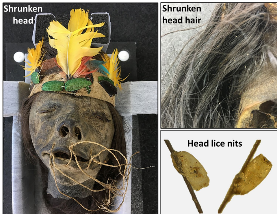
Figure 1. Shrunken head infested with head lice nits.