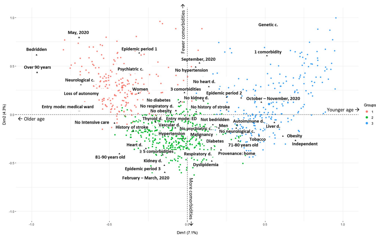
Fig. 2 Three clusters of deceased patients

Finally, the third cluster accounted for 25.2% of the deceased patients (blue dots in Fig. 2). These patients were younger (67.7 years on average). They were more likely to be diabetic (38.5%), obese (27.3%), of which 19.7% with massive obesity, and to suffer from pre-existing respiratory disease (29.5%). They were more likely to smoke (30.9%). A small percentage had specific comorbidities: genetic conditions (5.4%), liver disease (9.7%) and autoimmune disorder (8.3%). Their clinical pathway was different: most of them were admitted to the intensive care (85.3%), 40.6% came from other hospitals in the region, as well as the 6 patients who died without diagnosed comorbidity. In this cluster, patients were more numerous during the third epidemic period.