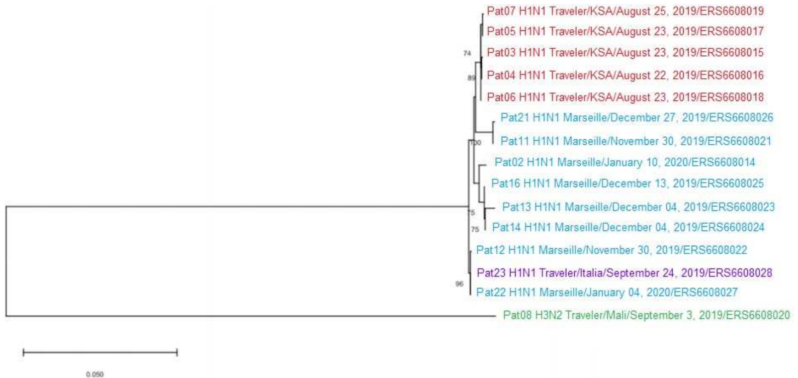
Figure 3: Molecular phylogenetic analysis of 14 sequences of influenza A/H1N1 viruses.