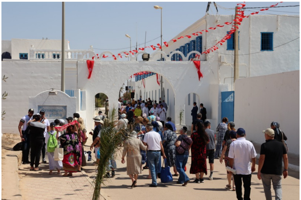
Fig. 1 Entrance of the Ghriba Synagogue in Djerba, 2022

This study consists of several nested developments, which first present the local and historical backgrounds of the phenomenon, thanks to numerous sources dating from the end of the 19<sup>th</sup> century to the present day. Then, after analysing the different foundation narratives, we focus deeper on the interfaith and inter-ritual dimensions, based on our ethnographic journeys. Besides the spontaneous attendance of the synagogue by some Muslim women, we also critically analyse the political speeches and the calls for tolerance, as well as the reverberation, on the pilgrimage, of the turbulent political context in Tunisia, but also in Israel-Palestine.