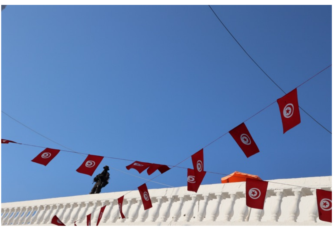
Fig. 7 Sniper on the roof of the Ghriba Synagogue, 2022

war movie, they love us so much! They are there, everywhere, downstairs, upstairs, on the roof!", the auctioneer said on the microphone. This overprotection reassured them and demonstrated, according to them, the consideration of the State that had not forgotten them. But in another sense, these security measures relativized the spirit of openness.