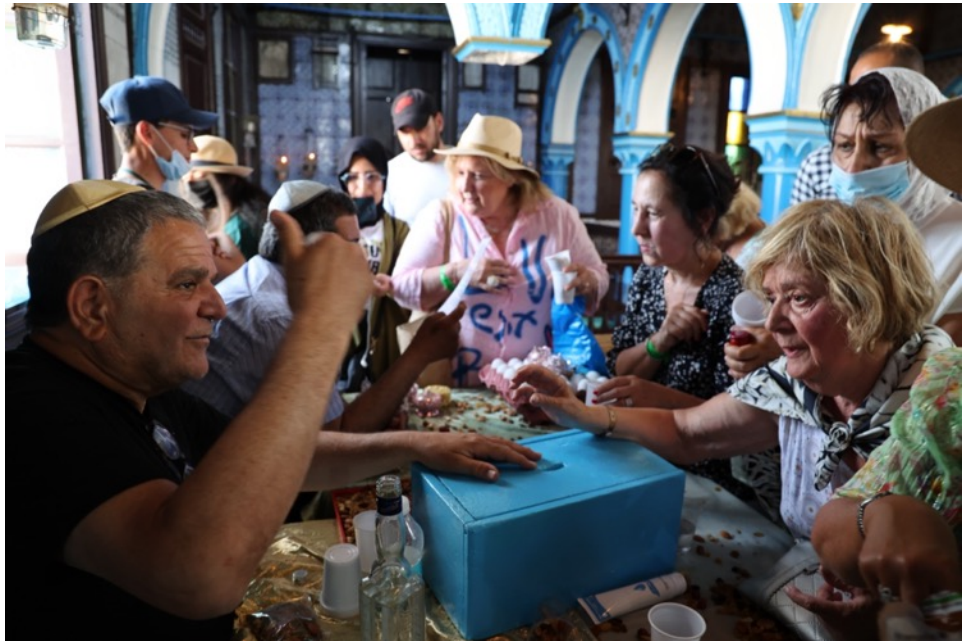
Fig. 2 Blessing of Pilgrims in the Synagogue, 2022

sanctuary, which leaves much room for the fervour of popular devotions. According to our observation in 2014 and 2022, the synagogue becomes indeed the theatre of an intense ritual effervescence along the pilgrimage days. On the first room, a few Djerbian rabbis sitting on benches recite prayers for visitors who make offerings in exchange. These sacred gifts and countergifts are materialized by the sharing of biscuits, dried fruits, and fig alcohol ( bukha ). Pilgrims mix various languages, whatever Arabic, Judeo-Arabic, Hebrew, and French.