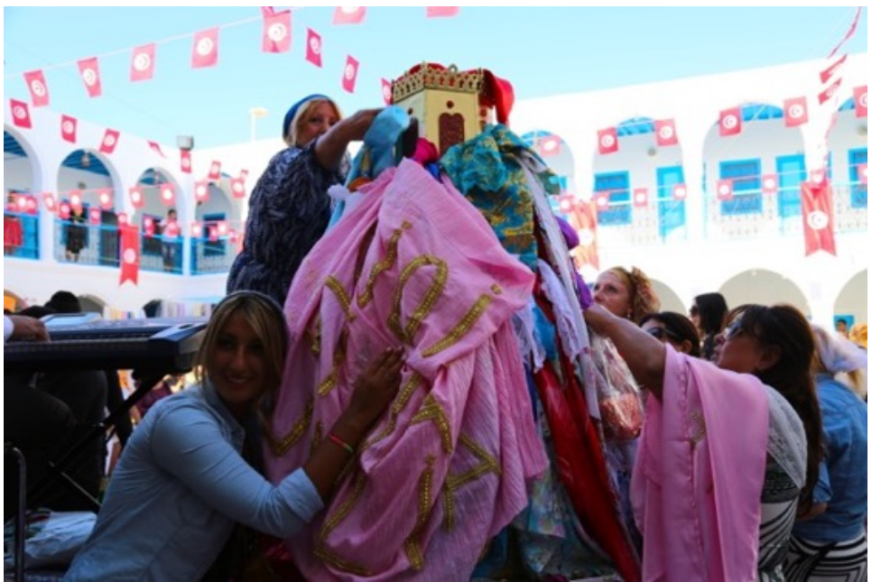
Fig. 5 The Ghriba Menara, 2014

scarves of fabric and artificial silk to it. Then came the crucial sequence of the auction of the Menara rimonims , which are the silver ornaments of the Torah placed atop the candlestick on this day. Pilgrims were publicly competing - for up to several thousand dinars - for the privilege of symbolically acquiring these holy pieces, which were then returned, while large sums of money became donations to the shrine.