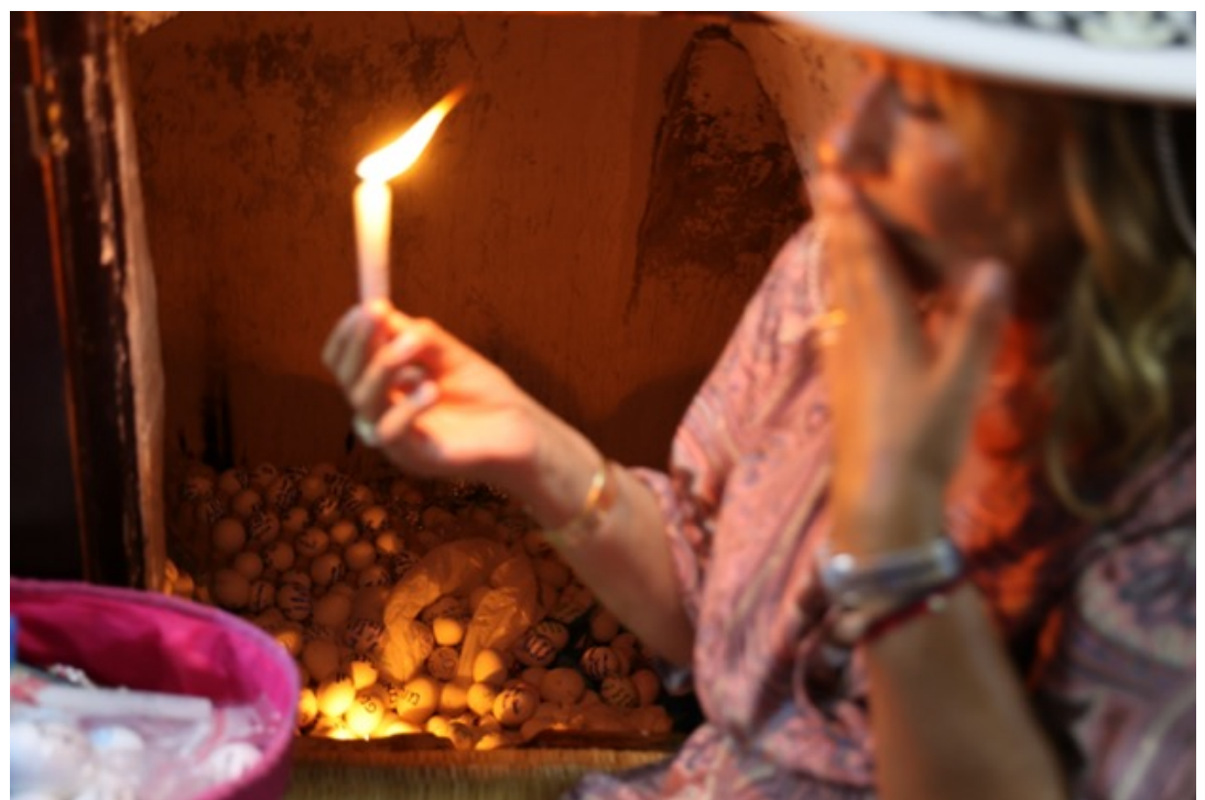
Fig. 4 A Woman Pilgrim and Votive Eggs, 2022

From a theoretical point of view, these few examples - which would deserve a longer and more detailed ethnographic description<sup>38</sup> - lead to understand the space-time of pilgrimage as an arena of heterogeneous practices and behaviours that cohabit under the same roof. Then the theoretical model defined by John Eade and Michael Sallnow<sup>39</sup>, who see pilgrimages as "empty vessels" that pilgrims fill with the meanings of their choice, seems particularly operative, including at the ritual level.