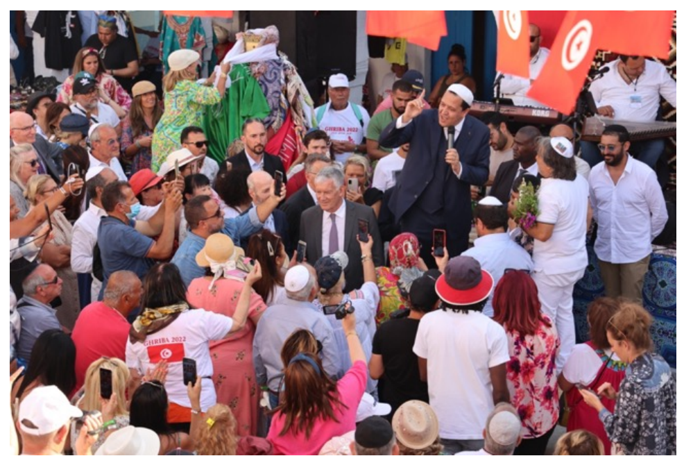
Fig. 6 Tolerance speech of imam Hassen Chalgoumi, 2022

After the break imposed by the Covid-19 pandemics, the pilgrimage resurrected in may 2022. And also in this occasion the pilgrims were welcomed in the area of the synagogue by the new Prime Minister, Najla Bouden, accompanied by the Minister of Tourism, Mohamed Moez Belhassine<sup>43</sup>. The German, Canadian, and French ambassadors were also present. The case of Hassen Chalgoumi is symptomatic of this official poly-rituality: known as the imam of the French city of Drancy, this French-Tunisian citizen was invited, as special guest, to deliver a speech of tolerance by the auction moderator in those terms: "Bless him! (...) May God give us 500 million people like you! May we have peace in the world, may we have shalom , may we have salam , may we find ourselves, Jews and Muslims: we all love each other and we want to love each other!" Then the imam declaimed the rhetoric of living together to the crowd of pilgrims: "The Ghriba is a miracle! It connects us all, it is a flame of hope!" His words were greeted with thunderous applause.