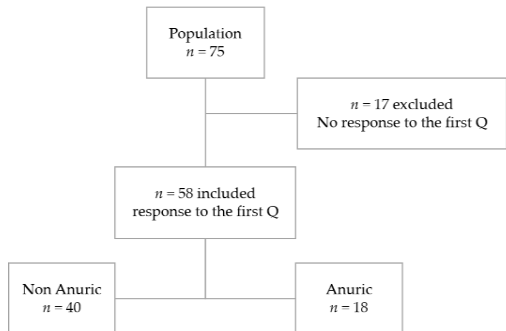
Figure 1. Flow diagram. Q: food questionnaire.

Seventy-five patients were included in the initial protocol. Of the 75 participants selected for the study, 58 (77%) answered the first questionnaire as illustrated in a flow diagram Figure 1.