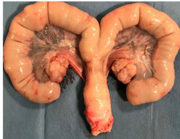
Figure 3. Uterus harvested. The right side was embolized with gelatin torpedoes, the left side was embolized with suture fragments. There was no difference in mucosal staining between the two sides, including no evidence of necrosis.

There was no evidence of right- nor left-sided uterine necrosis in any of the explanted uterine bodies. There was homogeneous and similar mucosal color between the two groups, with no significant difference in uterine trophicity (Figure 3).