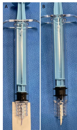
Figure 1. Comparison between a 1 cm long Optime 0 suture fragment (A) and a gelatin torpedo as usually shaped (B).

Absorbable polyglycolic acid (PGA) braided sutures Optime® (Peters Surgical, Boulogne-Billancourt, France) were used. Fragments were obtained by a sterile cutting of the sutures during the embolization procedure with standard scissors with the objective of a one-centimeter-long fragment. The diameter of the suture was between 300 and 400 (size 0 USP, United States Pharmacopeia). The suture fragments were compared with an absorbable gelatin sponge torpedo usually used in UAE procedures according to the current practice performed in humans (Figure 1). The torpedoes were calibrated to approximately 1 cm as is typical for this type of procedure. The resorbable gelatin was derived from purified porcine gelatin (Curaspon®, Curamedical, Assendelft, The Netherlands) [15]. The left-sided uterus was embolized with centimetric suture fragments, and a comparative embolization with absorbable gelatin sponge was performed in the right-sided uterine artery.