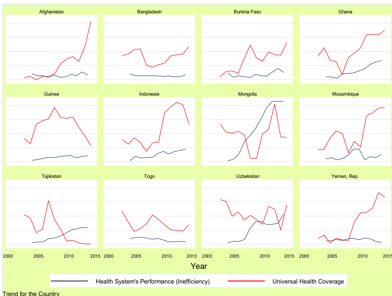
Fig. 1 Cross-dynamics: The health system's performance (inefficiency) and the Universal Health Coverage.

system for U5 mortality in seven LICs and five LMICs over the period of 12 years (2003–2014). Coverage of essential health services for child health are established as one of the tracer indicators to track the UHC. Inspired from the approach of “mashup” index, we first developed the UHC index for U5 mortality in the framework of the UHC cube (where we have allocated weights as 30% for each of the service coverage and the population coverage, and 40% weight for the financial protection). We applied a 3-step approach—first, we derived the UHC index for seven LICs and five LMICs showing levels of the UHC attainment, and changes and trends therein. Second, using SFA methods, we generated scores of efficiencies for the 12 countries under this study and obtained the result of extent of inefficiency in the performance of the national health system. Finally, we applied Granger non-causality test to a heterogeneous panel data model with fixed coefficients to ascertain the direction of causality between the UHC and the HS p .