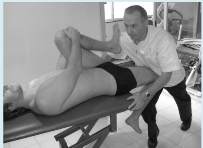
Figure 1: Stretching procedure.

Position of the subject: the subject sits on a chair raised by 5° horizontally and inclined by 20° vertically (standard position so as to enable a comparable performance between all the subjects) [26]. The patient does not look at the monitor screen so as to avoid an increase from 6.4 to 7.2% in his or her performance due to this factor [27]. The arms are placed straight down the body with the hands gripping the handles. To reduce compensation the subject is held still by two thoracic straps which are crossed to prevent flexing movements from the torso, a pelvic strap to prevent pelvic movements and a femoral strap on the assessed leg to ensure that flexion of each body part occurs independently from the rest. The non-assessed leg is free from all binding and no instructions are given for any particular voluntary movements of the latter. This is so as not to influence the results of the assessed limb [28]. The axis of rotation of the lever arm of the dynamometer coincides with the knee's axis of rotation (Figure 1).