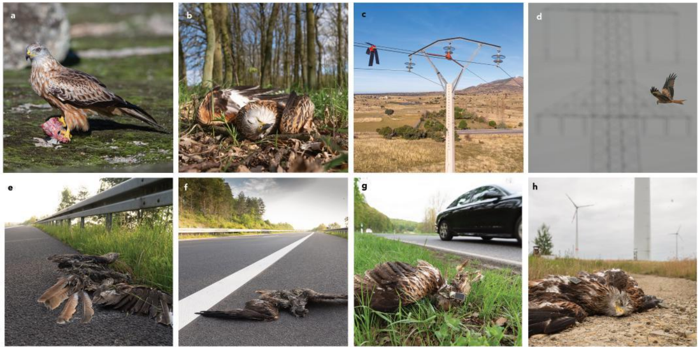
Fig. 2. Anthropogenic sources of mortality for red kites: (a) and (g) consumption of poisoned baits; (b) collisions with power lines; (f) electrocution at electric pylons; (c), (d), and (h) collisions with vehicles; (e) collisions with wind turbines.

human-mediated food, including livestock carcasses and other waste, could induce declines in reproduction during the breeding season and elevated mortality during the non-breeding season (Blanco, 2014; Blanco et al., 2017; Fulco et al., 2015; Pitarch et al., 2017). Disturbances around nests and habitat destruction might cause severe impact in local populations through reduced reproduction or reduction in the number of breeding territories (Carter, 2007; Davis and Davis, 1981; Seoane et al., 2003; Vinuela et al., 1999), which may be partly attributed to high breeding fidelity (e.g., using the same territory for up to 18 consecutive years; Ortlieb, 1989).