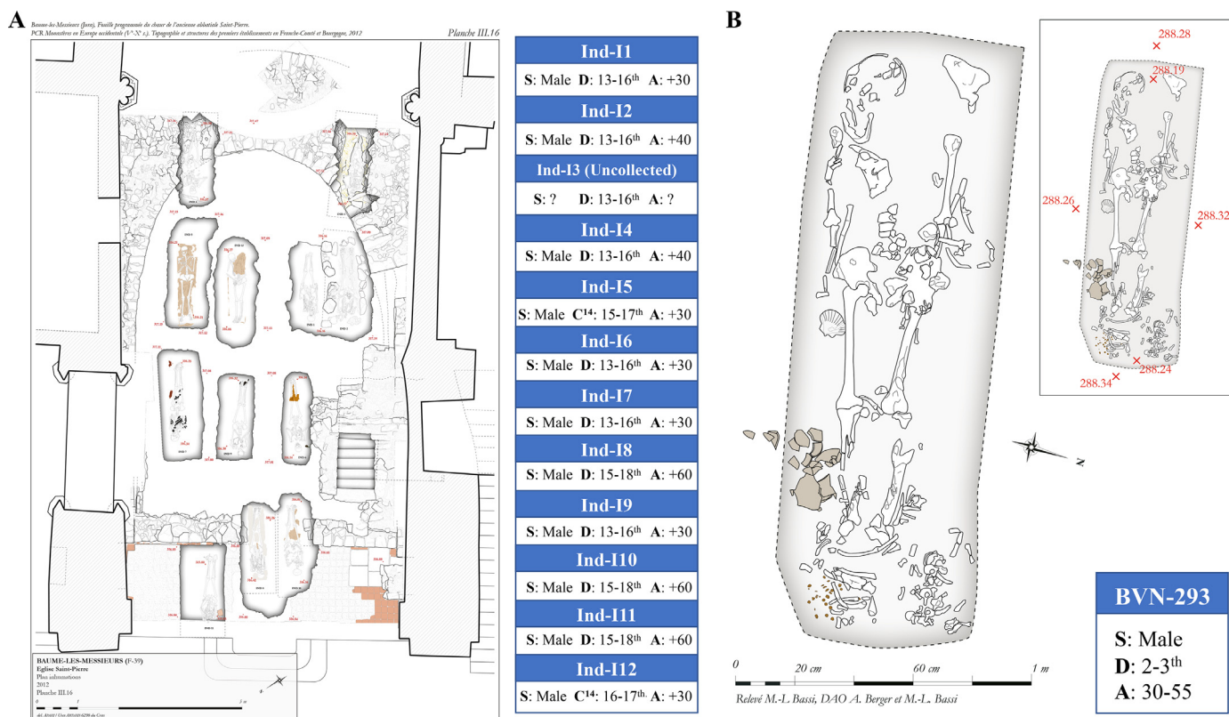
Figure 1. Localization, burial, dating and age information about individuals buried in the choir of the Saint-Pierre abbey, Baume-Les-Messieurs, France (Panel a), and one individual buried in Viotte Nord, Besançon, France (Panel b). Figures a and b are adapted and reproduced from the original archaeological report produced by Bully and Bassi [18,29] with their kind authorization.

Abbreviations: A, age; C 14 , carbon-14; D, date; Ind., individual; S, sex.