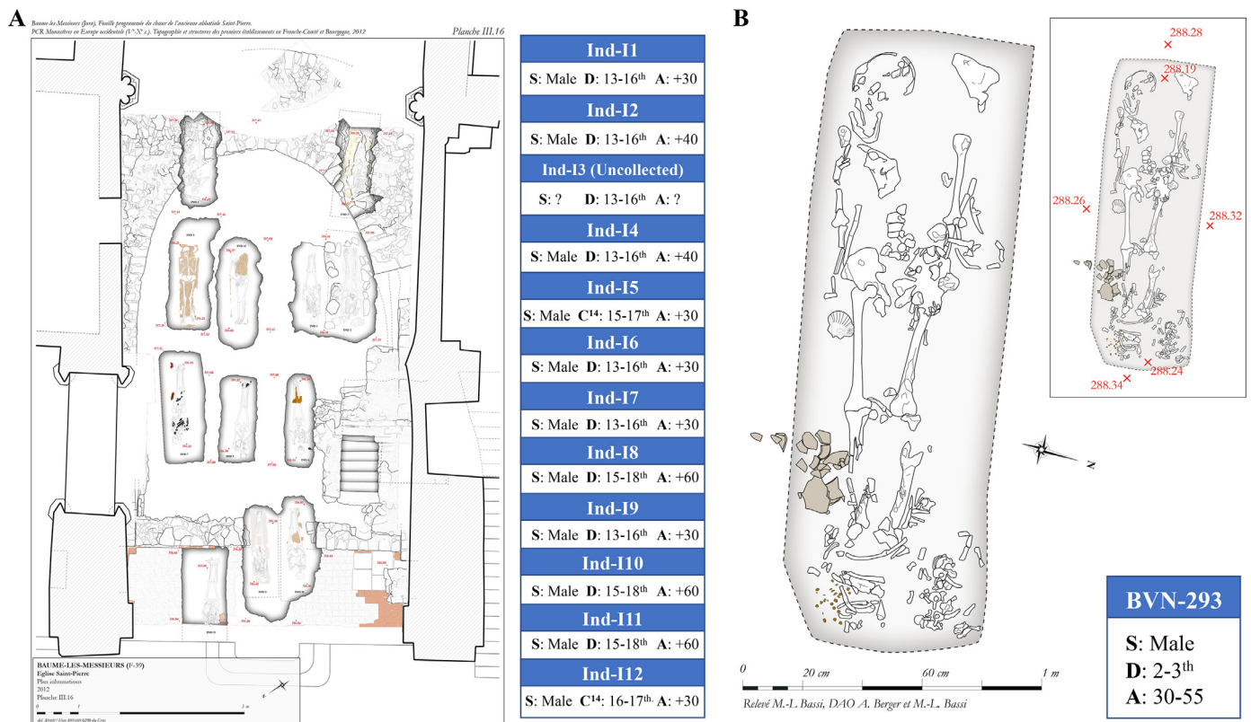
Figure 1. Localization, burial, dating and age information about individuals buried in the choir of the Saint-Pierre abbey, Baume-Les-Messieurs, France (Panel a), and one individual buried in Viotte Nord, Besançon, France (Panel b). Figures a and b are adapted and reproduced from the original archaeological report produced by Bully and Bassi [18,29] with their kind authorization.

Abbreviations: A, age; C 14 , carbon-14; D, date; Ind., individual; S, sex.