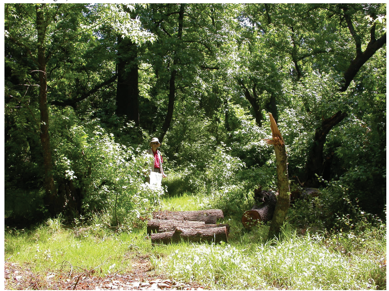
Figure 1. Habitat of Euryommatus berytensis in Turkey at Toparlar, logs of Liquidambar in the sunshine in a riparian forest. In this locality 18 specimens were collected on these logs and many more observed running, flying and copulating.

Euryommatus berytensis develops in the wood of Liquidambar orientalis Miller (Hamamelidaceae), Oriental Sweetgum, a tree commercially used to produce Styrax (or Storax) (Cebeci & Korotyaev 2019). The weevil can be found on standing trees, but also running quickly in the sunlight on logs of cut Liquidambar trees (P. Ponel, pers. observations; Fig. 1).