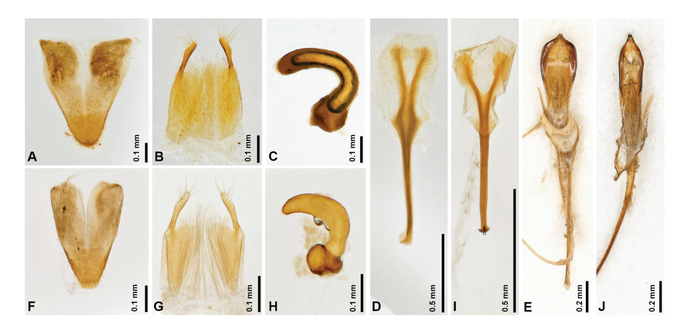
Figure 2. Genitalia of Euryommatus spp. A–E: E. berytensis : A, female tergite VIII; B, ovipositor; C, spermatheca; D, female sternite VIII; E, penis. F–J: E. mariae : F, female tergite VIII; G, ovipositor; H, spermatheca; I, female sternite VIII; J, penis. (photos: C. Germann).