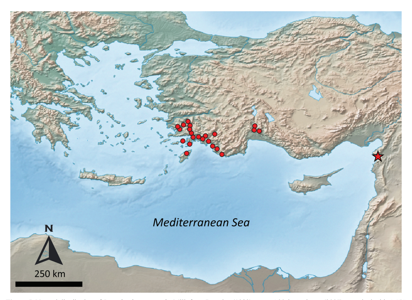
Figure 5. Natural distribution of Liquidambar orientalis Mill. from Browicz (1982), map n°66, in Amigues (2007) reworked with QGIS 3.30.1-'s-Hertogenbosch and Natural Earth. CRS EPSG 4326. The red star shows an ancient occurrence.