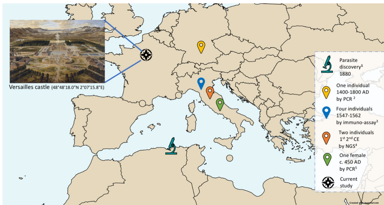
Fig. 1 European studies detecting the presence of ancient malaria. 1: First parasite discovery by Laveran [48], 2: Parasite detection in bone by PCR [17], 3: Parasite detection in bone by immune assay [18], 4: Parasite detection in molar by NGS [36] 5: Parasite detection in bone by PCR [35]

Paleomicrobiological and paleogenetic data, reinforced by ancient textual and iconographic descriptions, indicate previous occurrences of malaria in Europe [5]. However, the antiquity of malaria in human populations is poorly understood and has previously focussed on human remains from ancient Egypt, including mummies and non-mummy samples such as bones and teeth [6–16]. Studies have also been carried out in Italy [17–21] using molecular detection assays, including immunoenzymatic, polymerase chain reaction (PCR), next generation sequencing (NGS) and indirect immunofluorescence assays. The aim of this study was to evaluate the use of rapid diagnostic tests (RDT) to detect Plasmodium antigens in dental pulp from teeth collected from human remains. Here, immunochromatography detection of Plasmodium specific antigens in the presence of the appropriate controls was assessed on human remains collected from a sixth century Merovingian necropolis near the site of the world-renowned Palace of Versailles (Fig. 1).