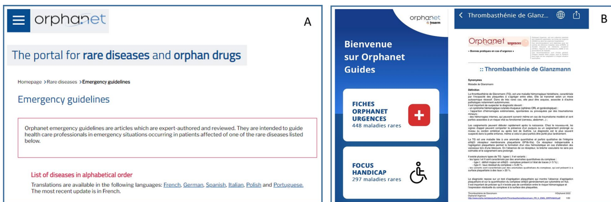
Fig. 1 Screenshots of Orphanet website (A) and the French application of Orphanet for mobile phone (B) where emergency recommendations are easily accessible