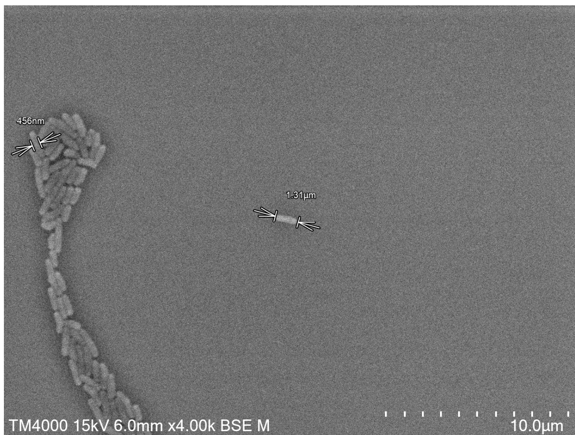
Figure 2. Scanning electron microscopy of L. manosquensis sp. nov., strain Marseille-Q4368 T using a TM4000 microscope (Hitachi High-Tech, HHT, Tokyo, Japan). The scale bar represents 10 µm.

For this strain, Marseille-Q4368T, several API galleries were performed, including API ZYM, API 50 CH, and API 20 NE. Positive reactions were observed for the following enzymes: esculin ferric citrate, esterase (C4), esterase lipase (C8), leucine arylamidase, cystine arylamidase, valine arylamidase, naphthol-AS-BI-phosphohydrolase, D-mannitol, D-glucose, D-maltose, malic acid, and \alpha -mannosidase. However, the remaining reactions yielded negative results. Additionally, the catalase test was positive, while the oxidase test was negative. The differential phenotypical characteristics of Leucobacter manosquensis strain Marseille-Q4368 and its closest related species are summarized in Table 1. Branched fatty acids were detected in the composition of strain Marseille-Q4368: 12-methyl-tetradecanoic acid (69%), 14-methyl-hexadecanoic acid (16%), and 14-methyl-pentadecanoic acid (7%). Additionally, unsaturated fatty acids were also detected in the cell walls (Table 2).