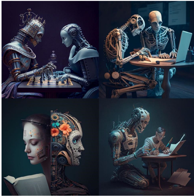
FIGURE 2. “Artificial Intelligence and Creativity collaborating” created with MidJourney software. [Color figure can be viewed at wileyonlinelibrary.com ]