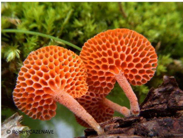
Figure 1. Favolaschia claudopus basidiomes.

The genus Favolaschia belongs to the Mycenaceae family within the order Agaricales. It is known for its poroid basidiomes that are found in dead plant materials worldwide. Previously considered as a variety of Favolaschia calocera , F. claudopus (Singer) Q.Y. Zhang & C. Dai has recently been elevated to the species status (1). F. claudopus is a wood-inhabiting fungus classified as an invasive species that has recently spread from Oceania to Europe (2; 3; 1). It is suspected that the introduction of this species may be favored by the presence of black locust ( Robinia pseudoacacia ), which is the primary host of F. claudopus . The adaptive capabilities of this species have raised concerns among mycologists as they could potentially endanger local fungal species (4; 5). The first specimens of F. claudopus in metropolitan France were observed in Pyrénées-Atlantiques