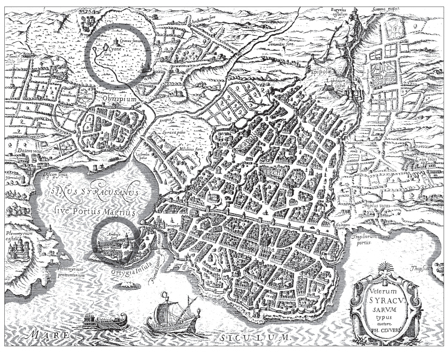
Fig. 1 – Localization of the springs Arethusa and Cyane on Cluver's map of the city of Syracuse. From Sicilia antica cum minoribus insulis, ei adjacentibus. Item, Sardinia et Corsica. Opus post omnium curas elaboratissimum; tabulis geographicis, aere expressis, illustratum, 1619; adaptation V. Gemonet, AMU/CNRS, CCJ, 2019.

ancient writers mention a second source, Kyane, located in the Syracusan chora . It has been identified with a spring in the Anapos River plain, about 5 km southwest of the ancient city.