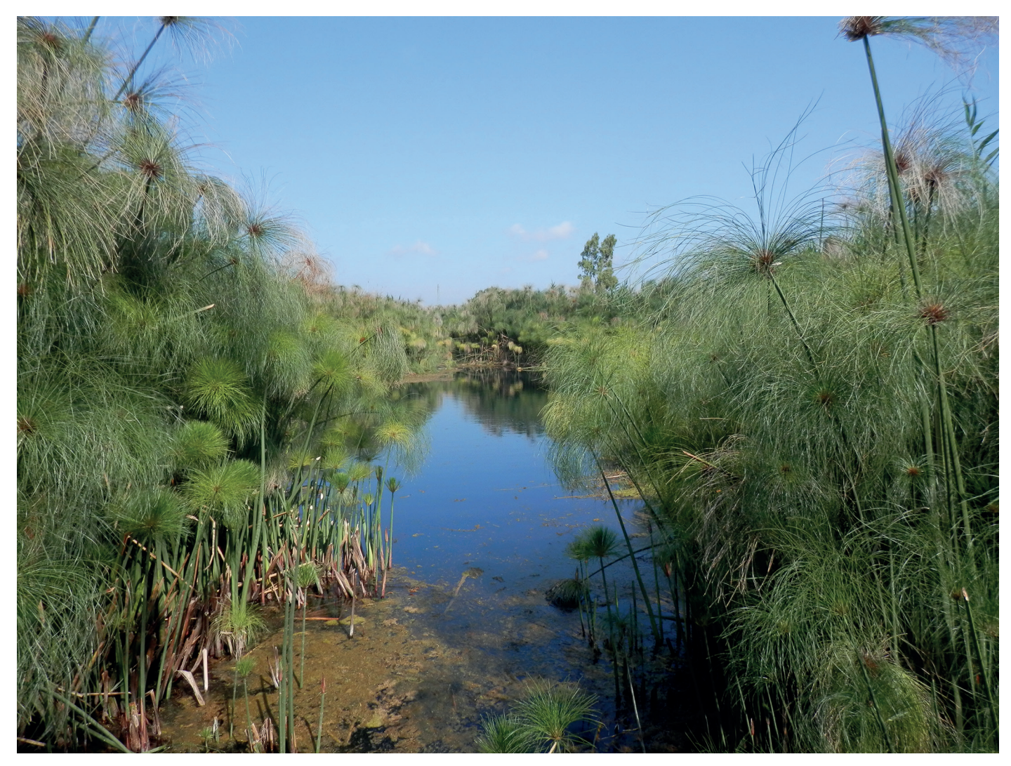
Fig. 9 – The pond of Kyane in the Syracusan countryside.