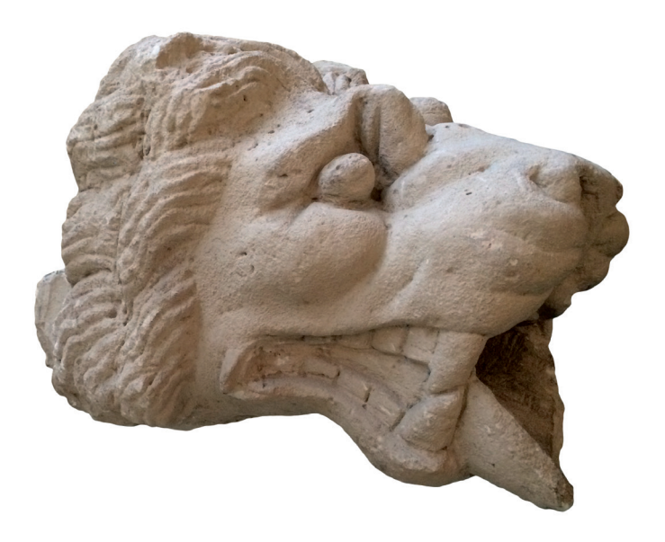
Fig. 11 – One of the two Waterspouts from Cyane's pond

major divinities. As mentioned above, the colossal Laganello Head was found near the spring (Fig. 10). If it was intended to represent one of the goddesses, as it seems most likely, I believe that it is best identified as Kore, because the cult instituted by Herakles was devoted to Kore and Demeter, not to a minor local divinity.