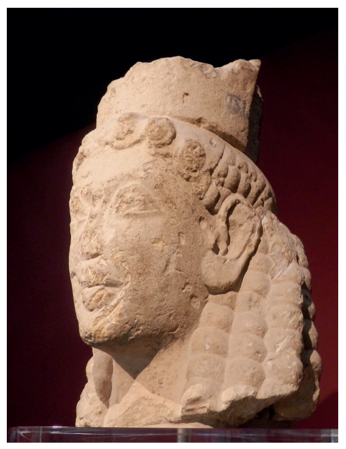
Fig. 10 – Laganello Head.

The historian writes both of the legend and the cult, and it is worth noting that Kyane does not appear as a nymph, but only as a \pi\eta\gamma\eta , the spring produced by Hades as he rushed into the Underworld with his captive. She remains anonymous and depersonalised. Even in the story of the spring's origin, Diodorus focuses on major deities, Hades and Kore. His narration of the Rape of Kore appears after Herakles's match with Eryx and before his battle with the Sikani and their leaders, local deities such as Leukaspis, Pediakrates or Bouphanas. The sacrifice is offered to Kore, not to the spring or its presiding nymph. The legend shows clearly the lesser role of the spring, which only comforts Herakles and, as she is considered a witness and a guarantor, she supports the cult of