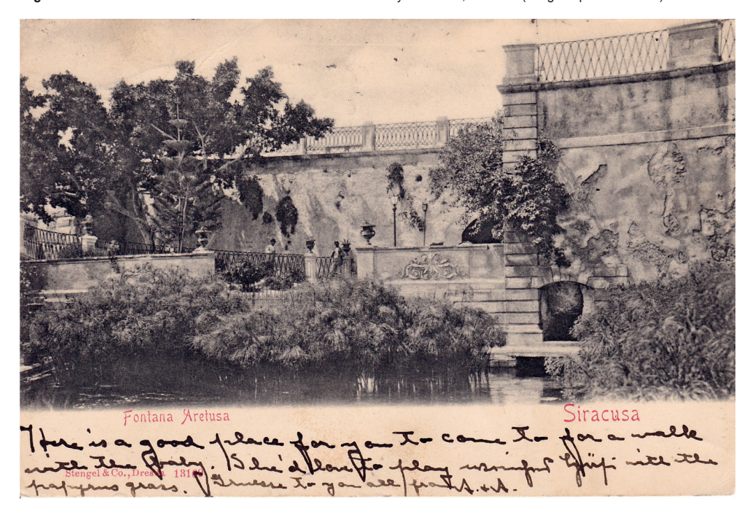
Fig. 4 – The Fountain of Arethusa near the turn of the 20<sup>th</sup> century. Postcard, ca. 1910 (image in public domain).