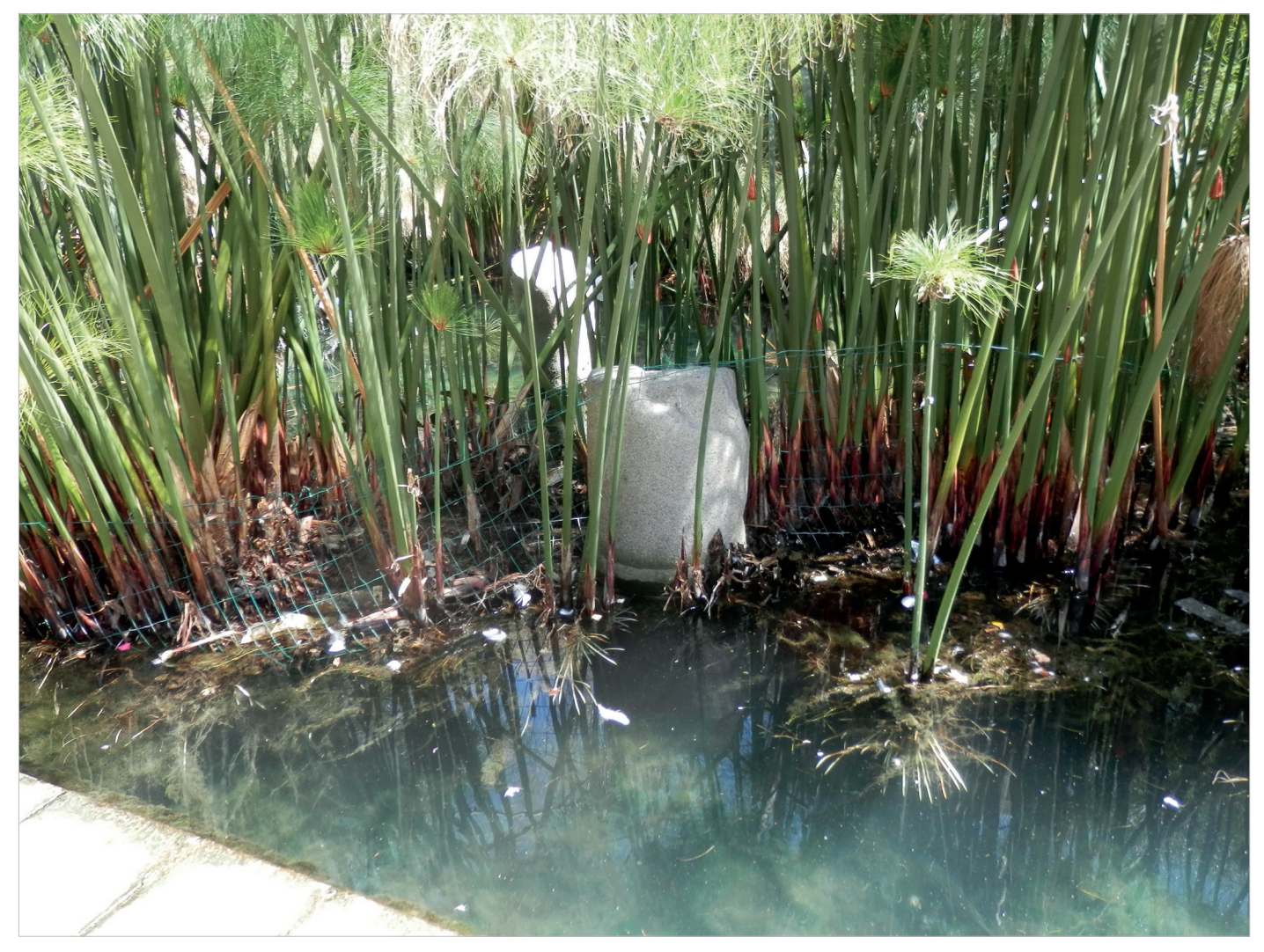
Fig. 6 - Ancient remains in the fountain of Arethusa.

view.<sup>10</sup> The common features of these images are a significant difference in elevation between the fountain and the town above, sometimes a flight of stairs, and two grotto-like openings, one in the high eastern escarpment, the other in a lower wall to the north.