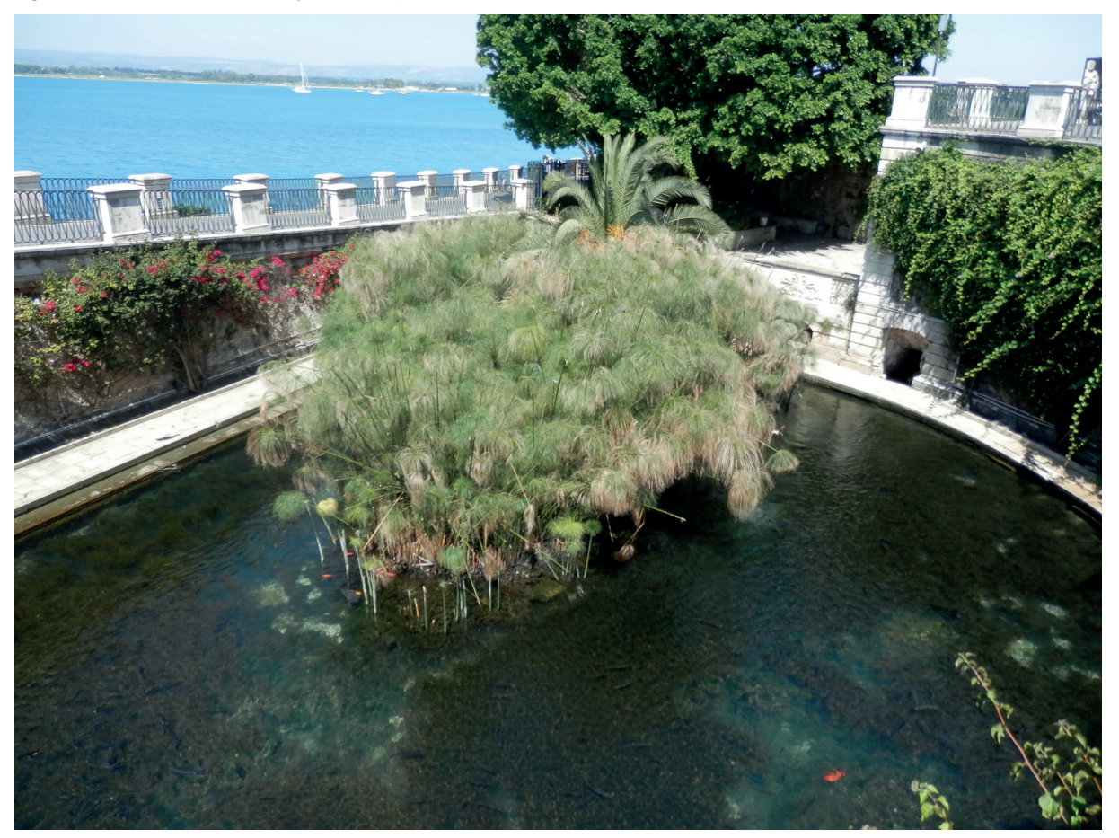
Fig. 5- The Fountain of Arethusa today.