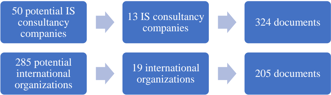
Figure 1 selection process for the international organizations and the IS consultancy companies’ communication documents

Annex A provides a descriptive study of our selected communication documents relevant to international organizations. These documents encompass a total of 1599871 words.