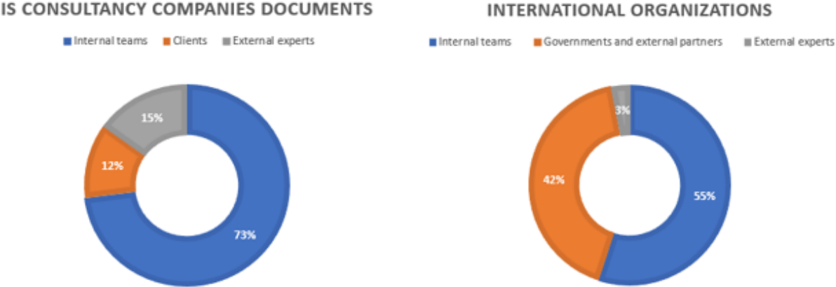
Figure 3 : Sources of the data in the different documents

This corpus of documents encompasses various sources of information that employ one of these discourse strategies and utilize legitimation to justify their positions and actions. Among IS consultancy companies, their documents draw on insights from external IS experts (15%), client feedback to validate the success of their projects (12%), and internal team assessments (73%). Conversely, international organizations leverage external IS experts from different backgrounds, including practitioners and researchers (3%), as well as some external partner organizations and government reports (42%). Additionally, they rely on feedback from their internal analysis teams (55%).