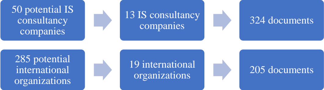
Figure 1 selection process for the international organizations and the IS consultancy companies’ communication documents

Annex A provides a descriptive study of our selected communication documents relevant to international organizations. These documents englobe a total of 1599871 words.